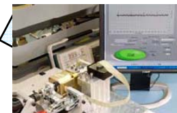
Automated Cal. & Test