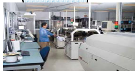
Pick & place