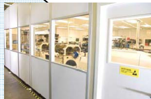
ESD Positive Pressure Room