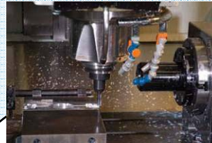
Prototyping & Production