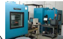
Electronic Product Testing ATP, ESS, HALT